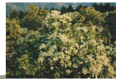
5 At the top you can find Lily-of-the-valley flowers