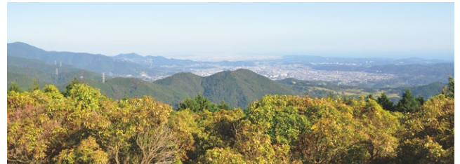
5 After climbing the steep front of Mount Shidango a 360 degree panoramic view opens up

The mountain is named after the legend of a mountain hermit in the Asuka era (538-710) called Shidagon, who is said to have established a residence at the top of the mountain and spread Buddhist teachings in the Yadoriki area. 'Shidagon' eventually became 'Shidango'.