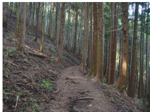
3 Enjoy a peaceful walk through the woods!